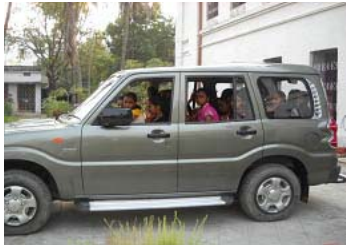
Bridge Course girls going to visit the Mala.