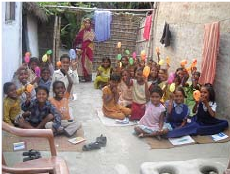
Celebrating Dipawali, November 14, 2010