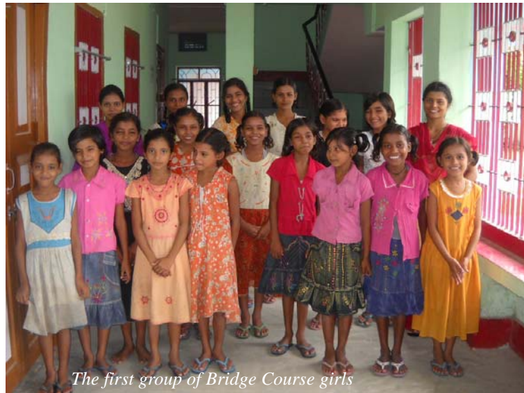
The first group of Bridge Course girls

Loving greetings from all of us. Finally I come to share with you in detail about Bridge Course Program. I hope you have been informed with some photos that our program started on July 2, 2010 in a very simple way. The parents brought the girls and a short welcome was given to them followed by some snacks and tea. The guardians signed the admission register and other document and left for their homes.