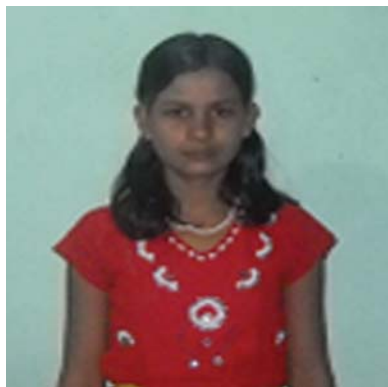
Sonam in April 2011