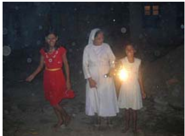
Bridge Course girls celebrating Dipawali with Sister Crescence & teacher.